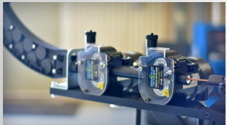
Tandem Wire Feed Assists Installed on a Mechanical Turn Table.