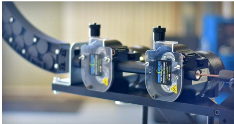
Tandem Wire Feed Assists Installed on a Mechanical Turn Table.