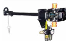
Extension Arm PFA-WM-EA