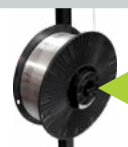
Spool option WGM-PFA-STAND-SPOOL