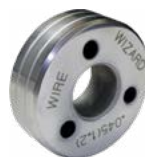
PFA Drive Rolls Various size options

All PFA drive rolls are hard chromed and polished for maximum performance and durability. Sold individually.